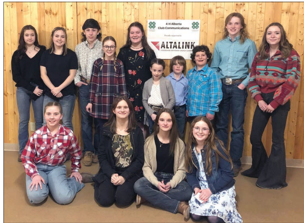
The Crowfoot 4-H Multi Club held their communications competition on Feb. 13 at the Nightingale Community Hall. The first and second place winners from each category will advance to the district level later this month.