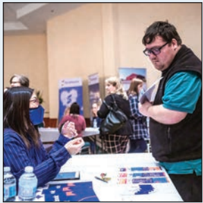
Successful job fair