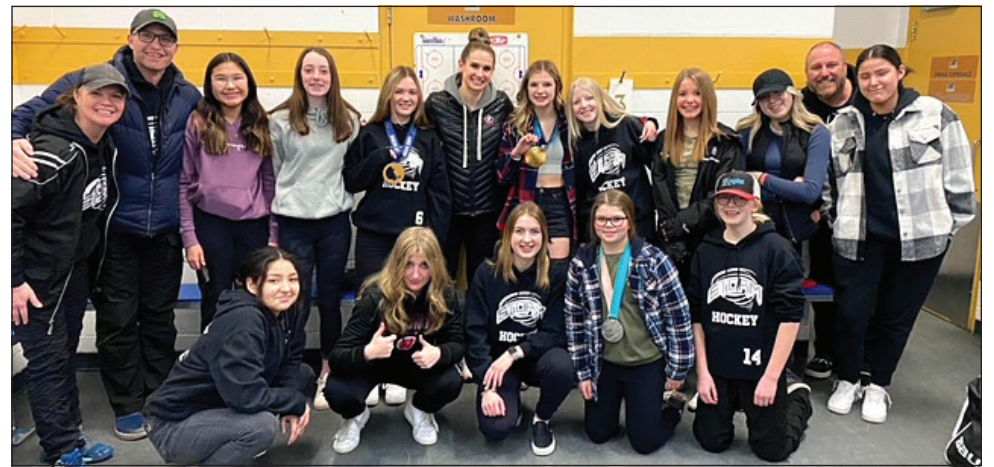
The Strathmore Storm U15 girls' hockey team is headed to Richmond, B.C. to compete in the Richmond Ravens Tournament to cap off their season. The team raised over $8,000 throughout their season to finance their tournament costs.