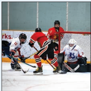
Host Raiders make south final

COVID-19 Update in Strathmore & Wheatland County (as of March 15, 2022)