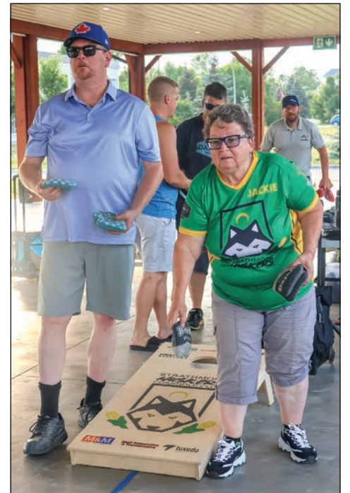
The Strathmore Huskers cornhole club meets Thursdays at 6:30 p.m. at the pavilion in Kinsmen Park until Aug. 15. The club hopes to introduce the sport to more players ahead of the new season in September.

“If you have got a bad leg or anything like that (which) would hinder you from playing other sports, you can probably come out and still play cornhole,” he said. “There is no real age advantage, it is very much a level playing field