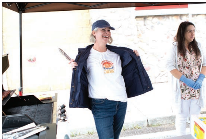
The Strathmore Municipal Library hosted a hot dog fundraiser outside the Peavy Mart, July 27, aiming to raise funds to support the facility. The fundraiser was hosted from 11 a.m. to 2 p.m.

Some of these include book clubs for teenagers and adults, poetry slams, equipment rentals for fledgling hobbyists, and