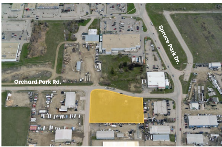
Lot 23, Block 01, Plan 981 3631 (137 Orchard Way)

Staff received an application for a land use redesignation ( Bylaw No. 24-16 ) 137 Orchard Way (Lot 23 Block 01 Plan 981 3631). The proposed redesignation aims to permit the construction of a multifunctional light industrial building with a health services facility at 137 Orchard Way in Strathmore.