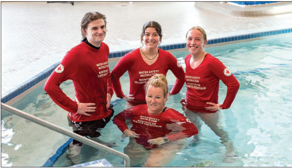
The staff at the Strathmore Aquatic Centre were eager to welcome back patrons after the Stage 4 water restrictions were lifted.