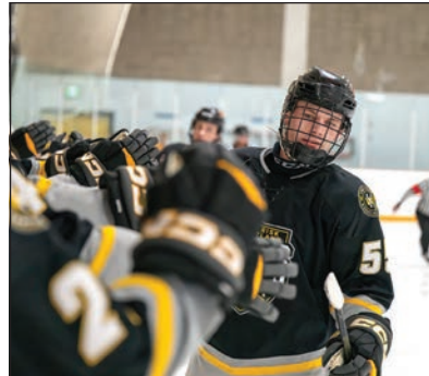
Joe Lepage Photos

The Wheatland Kings got back to their winning ways when they disposed of the High River Flyers 8-0 on Jan. 19 at the Strathmore Family Centre. After falling 8-5 on the road in Medicine Hat on Jan. 17, the Kings scored 5 power play goals to get back in the win column two days later versus the Flyers.