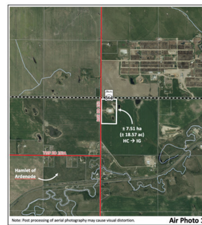
Lot 1, Block 2, Plan 1412199, within NW-22-25-25-W4M

Bylaw #: 2024-30 (LU2024-014) Legal Description: NW 22-25-25-W4M - Plan 1412199; Block 2; Lot 1 Proposal: To redesignate the subject lands from HC District to IG District, to facilitate the development of a water treatment and equipment storage and supply business.