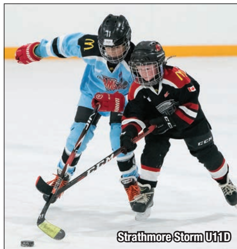
Strathmore Storm U11D