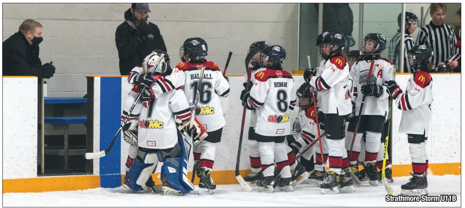
Strathmore Storm U11B