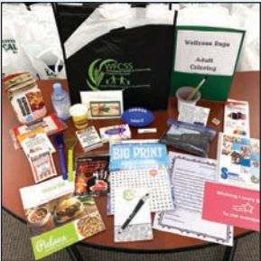
Welcomed wellness bags