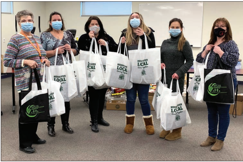
Wellness bags are once again being distributed by the Wheatland Family and Community Support Services to help get local clients and seniors through the winter months and alleviate some of the feelings of isolation.