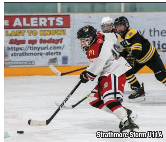
Strathmore Storm U11A