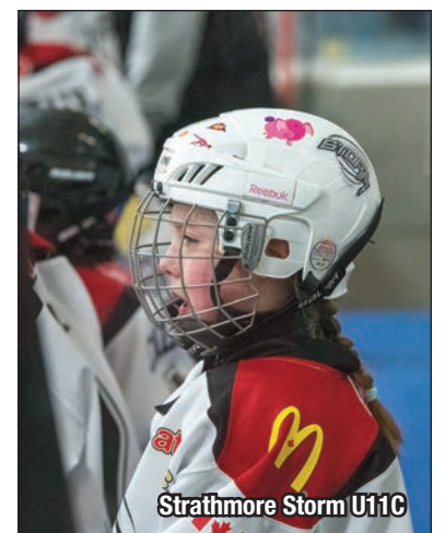
Strathmore Storm U11C