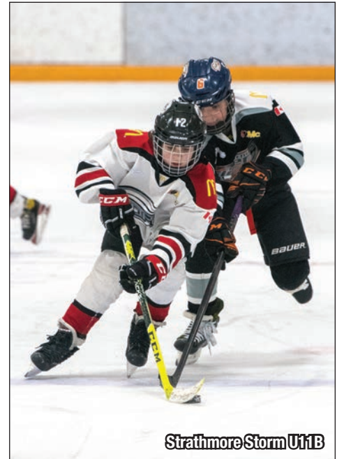
Strathmore Storm U11B