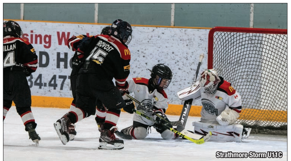
Strathmore Storm U11C