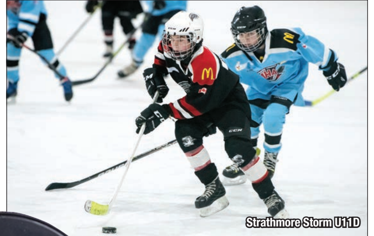
Strathmore Storm U11D