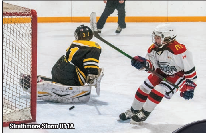
Strathmore Storm U11A