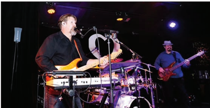
The Bamboo Guppies will be performing on Feb.10 at the Strathmore Travelodge presented by The Strathmore Musical Arts Society.