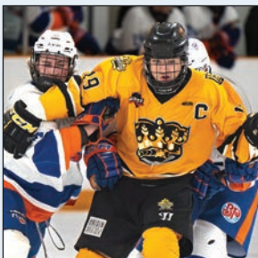
Kings gut check time