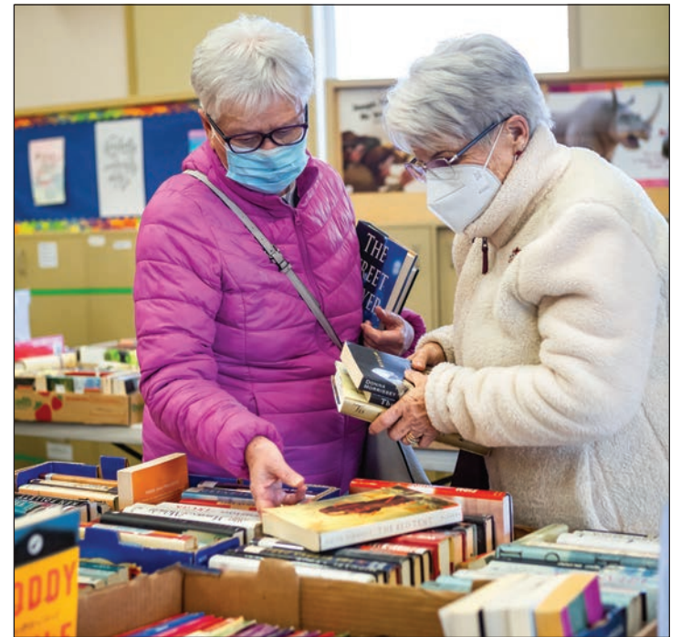
5 for Life was once again able to host their community book sale on Jan. 28, after collecting donated books from the community since November 2021. The annual sale was reported to have a surplus of literature, as it was unable to be held last year due to COVID-19 concerns.

Though ideally, the goal was to empty the tables and