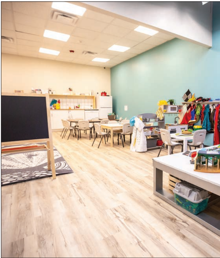
The new CORE childcare center held an open house on Jan. 26 for the community to drop by and view their newly renovated facility. The CORE team hopes to have 56 children who are preparing to enter the school system enrolled and using their space.

"It's a program that was custom built for them and not something I went into a building and had to kind of work