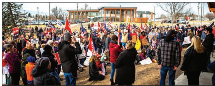
Many of the protesters who spoke to the gathered crowd at Kinsmen Park, Jan. 29, were simply those who wished to make their voices and opinions heard, rather than being dedicated organizers. Demonstrators rallied to show their support for the trucker convoy who gathered on Parliament Hill in Ottawa on the same day.

Prime Minister Justin Trudeau has issued a public statement, Monday, that he is not intimidated by the demonstrators and has no intention on repealing the mandate.