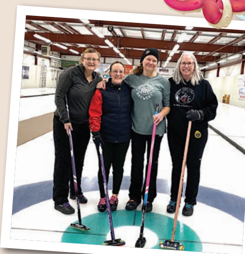
A Event Winners - The Jolly Rink They really dominated this year. Congratulations!