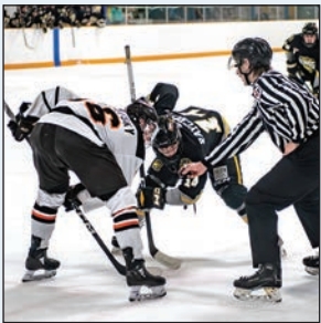
Kings on the brink