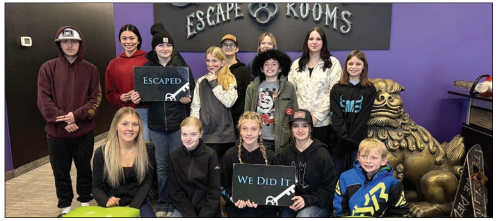
The Strathmore Rusty Spurs went to the Confined Escape Rooms and Laser City in Calgary as part of their annual Funday on Feb. 1.