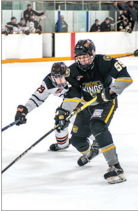
The Agra Risk Wheatland Kings have been pushed to the brink of elimination after a pair of losses, including a 5-2 loss on home ice Feb. 22 versus Medicine Hat. The local Junior B team must string together three wins in a row to keep their season alive.