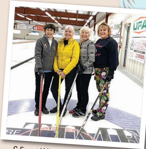
C Event Winners - Team Ryland They edged out Team Shack Attack for the win Congratulations!

Thanks again to all our generous sponsors, the volunteers, staff, and the out-of-town teams who travel to participate. It's very much appreciated.