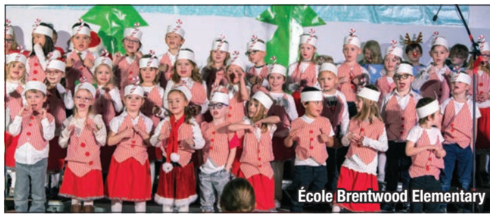
École Brentwood Elementary