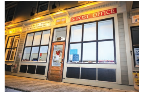
Canada Post is pulling the post office from Langdon at the end of December.

He recommended Langdon residents to call the Canada Post corporate office to make their concerns known to the company.