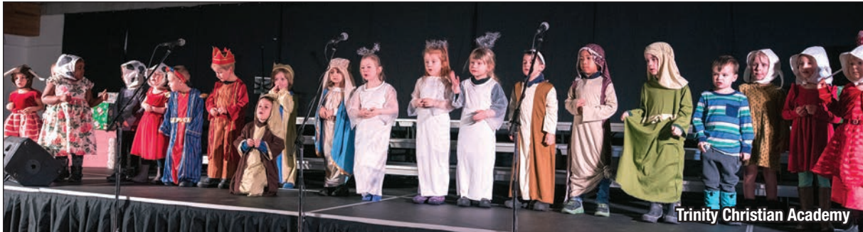
Trinity Christian Academy