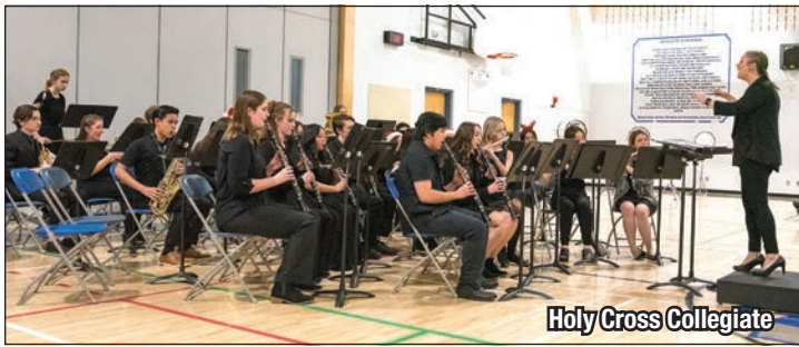
Holy Cross Collegiate