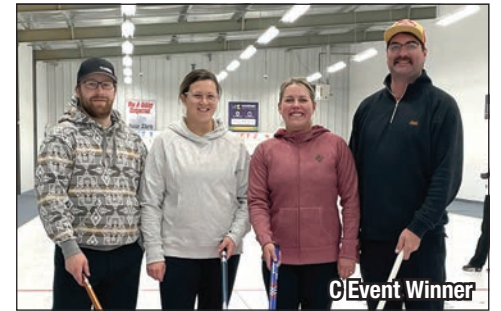
C Event Winner