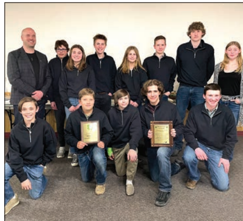
Rockyford 4-H Beef Club members show off the plaques they received during their 75th anniversary on March 19.