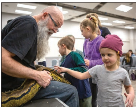
The Strathmore Wildlife Festival debuted at the Strathmore Civic Centre on March 25 and continued the following day. Locals were invited to come out and meet animals they might not normally interact with on a regular basis, to learn about conservation as well as the exotic animal industry.

This type of festival generally occurs more often in larger city centers, though Clevett wants to expand more into rural areas and invite everyone to learn and