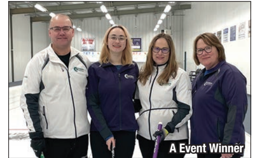
A Event Winner