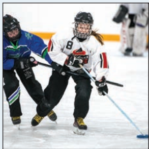
Ice host regionals