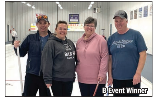
B Event Winner