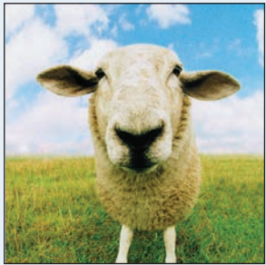
Solar farm grounds crew